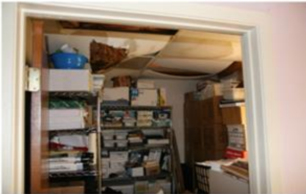
Office Area and Storeroom after Ike

On Saturday, September 13, at 2:10 a.m., Hurricane Ike roared ashore along the Gulf Coast. The Hisportic Christian Mission office is located in Friendswood, TX, which is about 30 miles inland from Galveston Island.